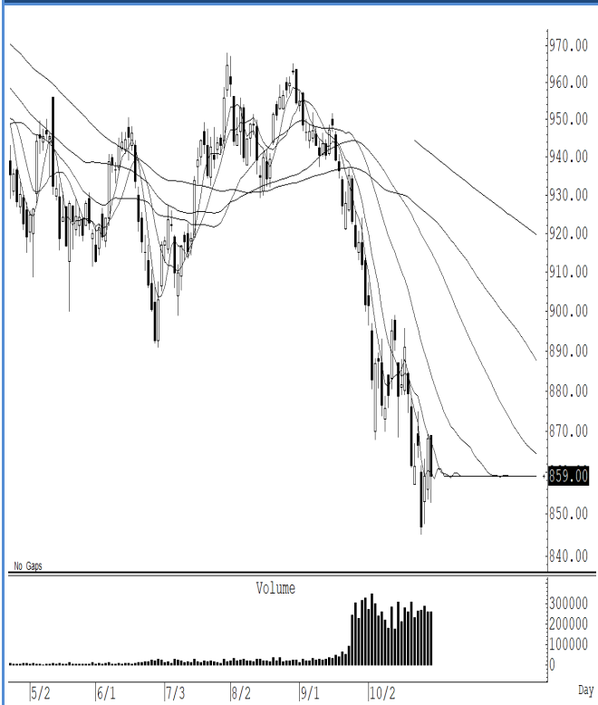
S50Z23 (Close 859.00 Chg -9.30)